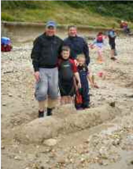
Team Sey – “Submariner’s Delight”

Tidal “windows of opportunity” were few and far between, but the initial attempt to hold the event on 18 th May was actually thwarted by human factors; it was a case of “non digit extractum” I’m afraid and the whole shebang had to be rescheduled for 12 th July.