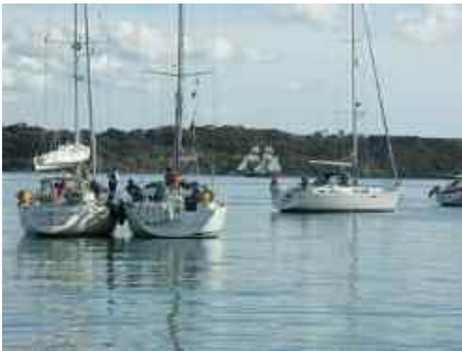
Meandering; taken from Rupert Deaton's boat "Toroo"