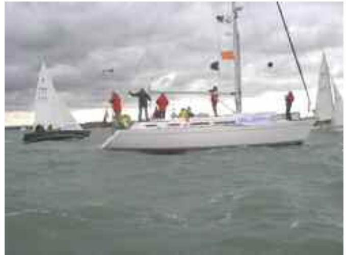
The Ineos Solent Circuit Committee Boat; "Fiddlers Dream"