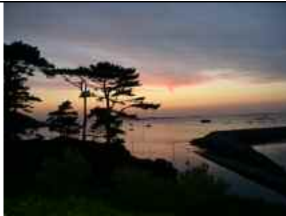
Treberuden at dusk

For Bookings contact Sandra Allpress 01590-643268