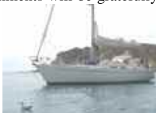
Ayres & Graces